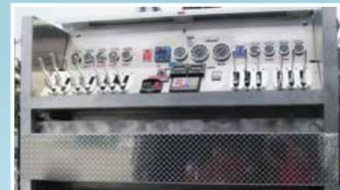
Top Mount Control Panel