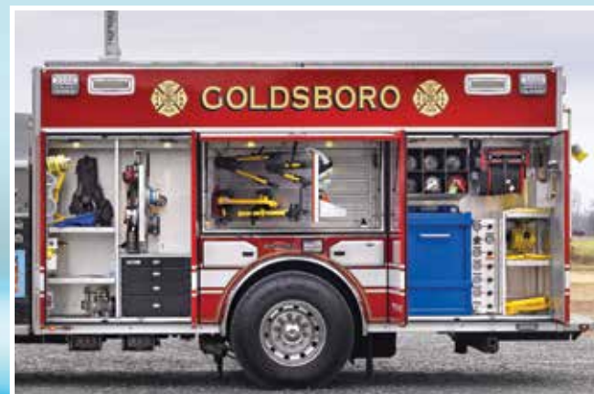
Full Depth, Full Height Side Compartment