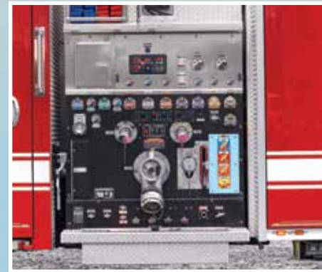
Black Thermal Coated Control Panel