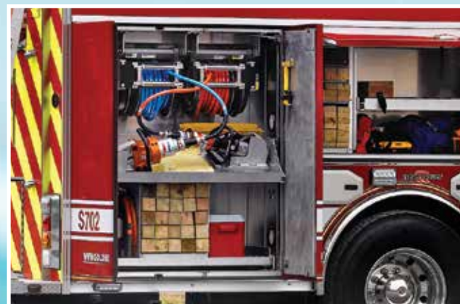
Full Width Access Compartments