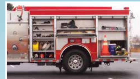
Customized Compartment Storage