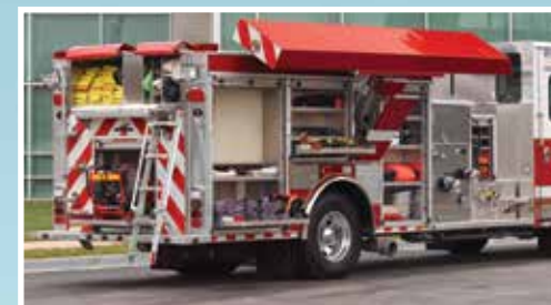
Enclosed Ground Ladder Storage