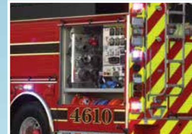
Operator's side pump control panel