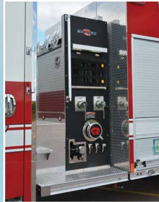
TP3 Pump Control Panel with Sealed Lever Bank