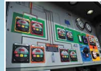
Logi-Color pump control panel