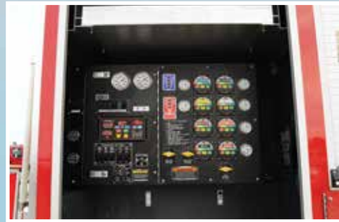
Curb Side Pump Control Panel

A rear mount offers your department more compartment area for equipment storage, keeping the tools you need close at hand during calls. Pump control panel locations can be either on the operator's, back, or curb side.