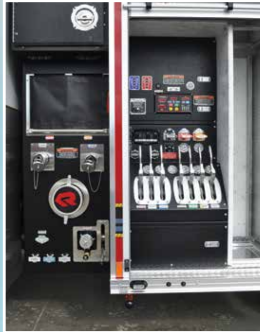
MP3 Pump Control Panel with Sealed Lever Bank

The MP3 has a short wheelbase of 170" and the TP3 has a 188" wheelbase.