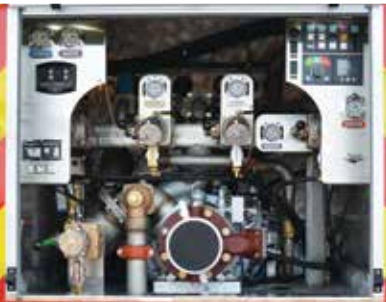
Open Pump Control Panel