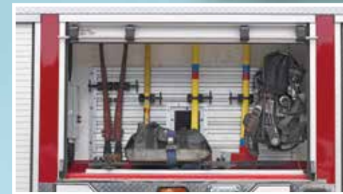
Customizable tool storage