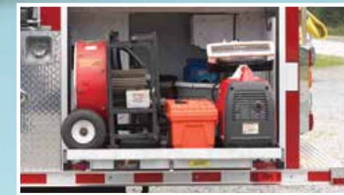
Slide out equipment trays